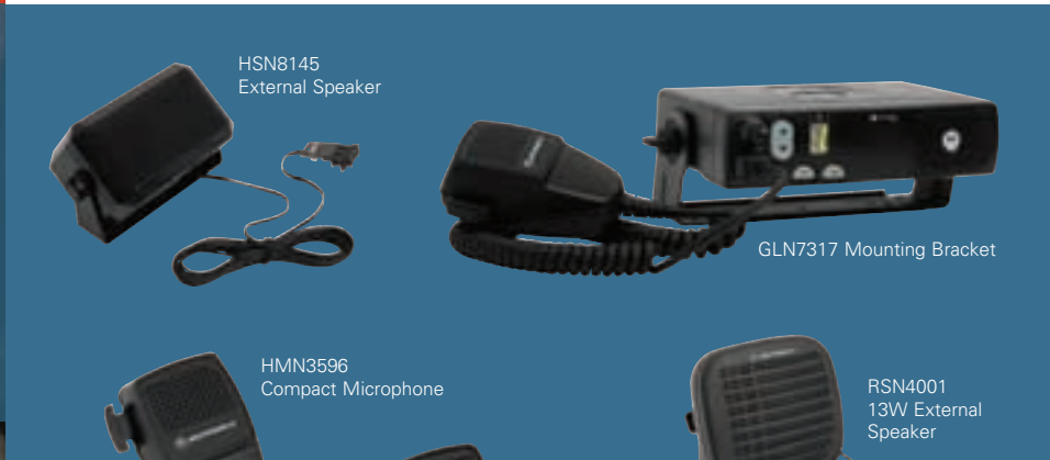
HSN8145 External Speaker